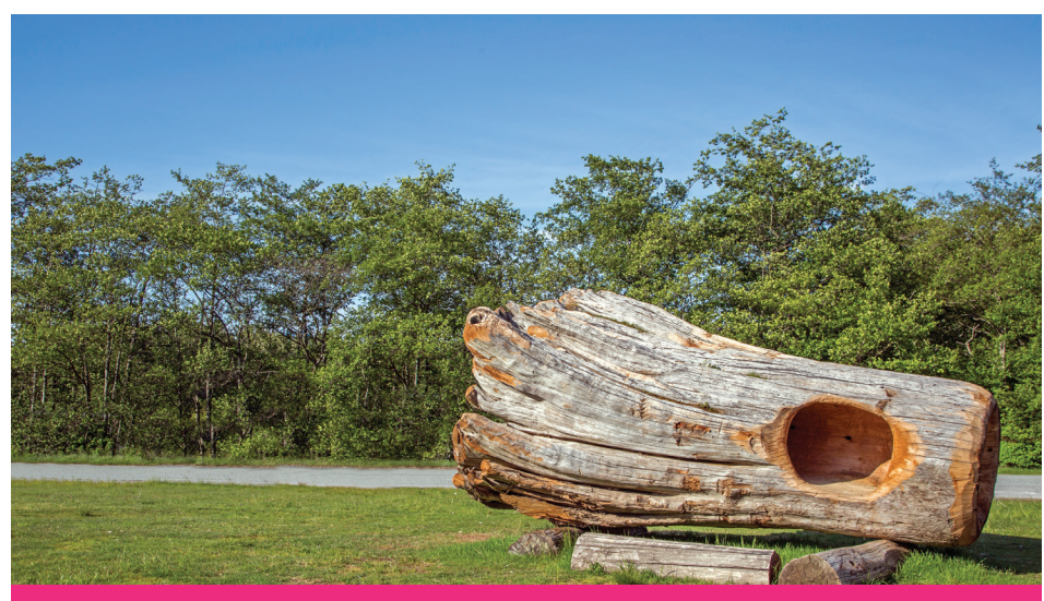
#1 - URBAN FURNITURE @ LITTLE SMOKE BLUFFS PARK