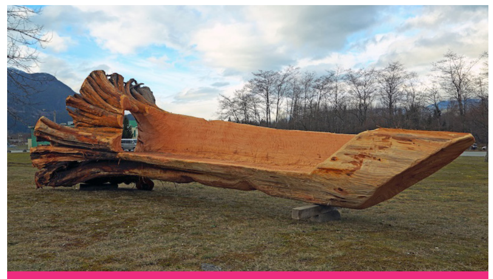
#5 - URBAN FURNITURE @ ROSE PARK - HUGO FRANCA

Urban Furniture Hugo França Vancouver Biennale 2014-2016