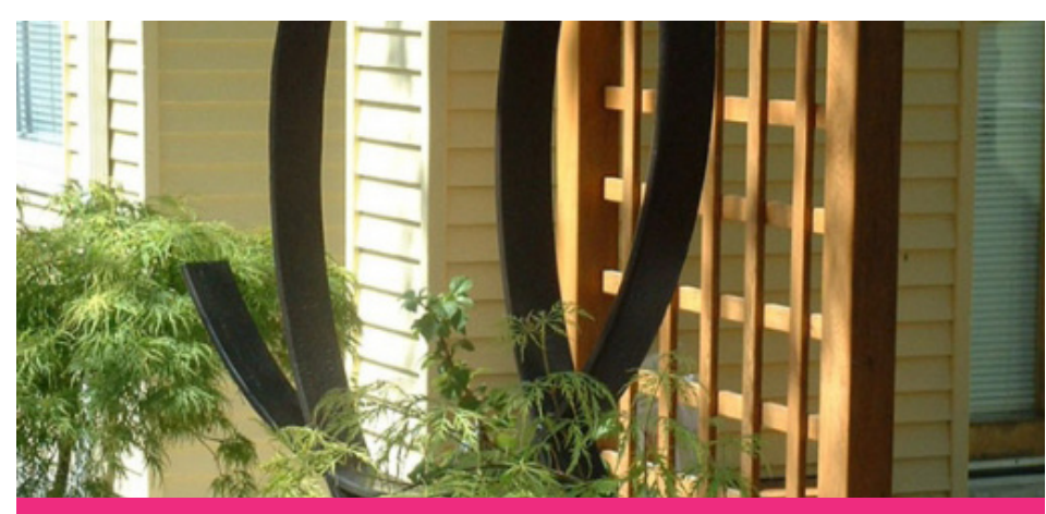
#4 - FREE WHEELING - SHARON PERKINS