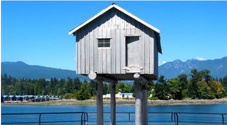
#5 - LIGHTSHED - LIZ MAGOR